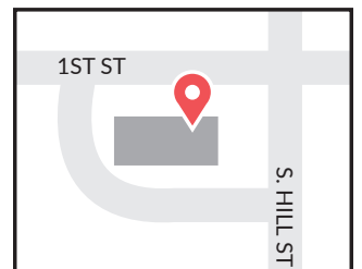
BUSTER KEATON MUSEUM PIQUA, KS